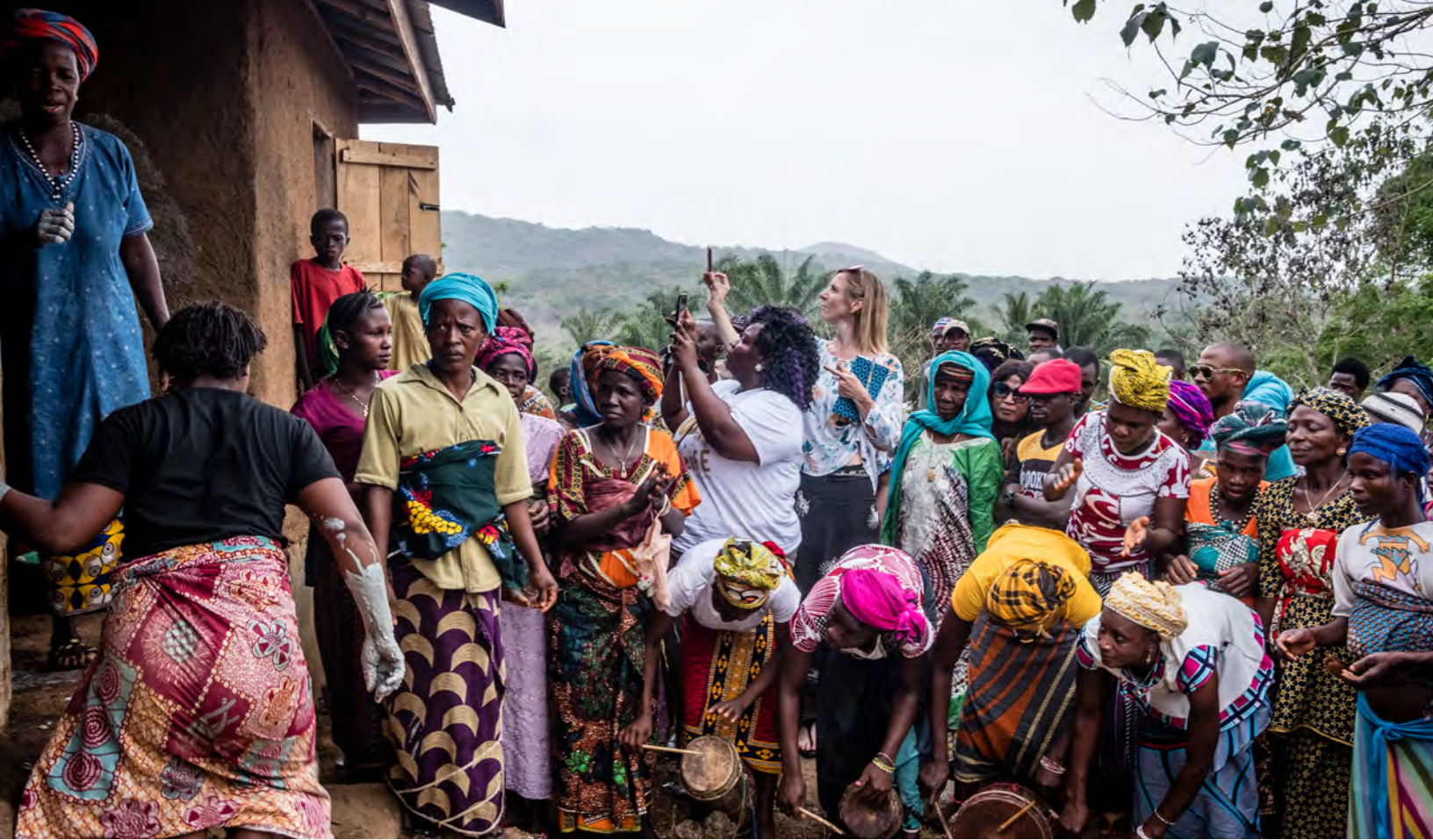
Constellating Peace delegates visit the Madina Community Health Post, in Kasunko Chiefdom in Koinadugu District. Community members raised the needed funds and helped build the post.

The transformative power of putting the wisdom, dignity, and capacity of local communities at the center—of the peacebuilding work and of the Constellating Peace cohort—was not limited to visitors to Sierra Leone. One of the Peace Mothers attending the program wrote that meeting participants from troubled places around the world showed her how far Sierra Leone has come. “My country is more peaceful than other countries,” she wrote in a reflection. Another wrote, “Sierra Leone people can do things that can be admired by other nationals, to the point they will want to replicate it in their own countries.”