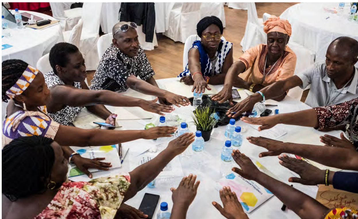
Delegates engage in creative conversation about inside-out peacebuilding in their own contexts.

of Sierra Leone, which only two months before had formally launched its new National Development Plan, incorporating the core elements of Fambul Tok's People's Planning Process (PPP) as the foundation for people-centered national planning. This is part of the Government's implementation of the Wan Fambul National Framework for Inclusive Governance and Local Development , which represents a commitment to fully scale the PPP, after it was successfully piloted in three districts across the country. The PPP allows villages to articulate their priorities and visions, and the Wan Fambul National Framework makes those priorities the drivers of national development for the first time in the country's history. "The Wan Fambul National Framework in my view and in the view of the government is a unique experience of government policy designed to put people at the heart of development," said Prof. David. J. Francis, chief minister of Sierra Leone. "This framework ensures that our country's development is led and owned by the people."